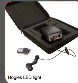
Hogies LED light