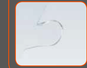
Hogies lens surface after cleaning with Hogies dynamiclens+