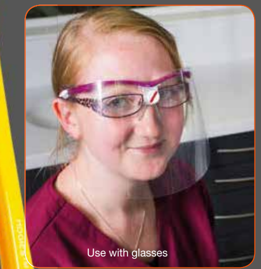
Use with glasses

Hogies visors are fully adjustable and easily integrated with most prescription spectacles. Hogies visors are available in seven exciting colours to compliment surgery and corporate colour themes.