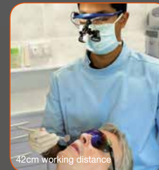
42cm working distance