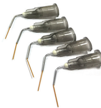
MICRO TIPS 27.5G - OW110900