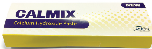
CALMIX CALCIUM HYDROXIDE PASTE 1.5ML SYRINGE - OW110815