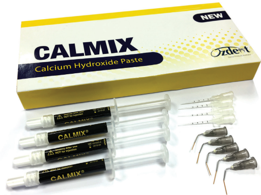
CALMIX CALCIUM HYDROXIDE PASTE KIT - OW110816